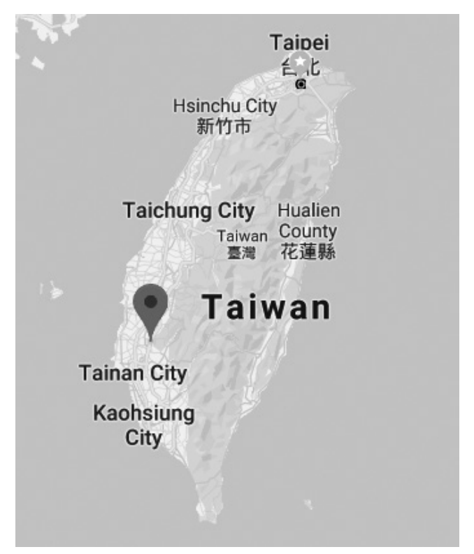
Map. 1. Location of the Hoan-á-chhân (潘仔田) Sirayan community in the Koa<sup>n</sup>-tiân (官田) area of southwestern Taiwan.

As noted above, the linguistic and anthropological evidence is to the contrary – that is, the Austronesian languages and cultures originated in Taiwan and spread throughout Southeast Asia and the Pacific. However, several sources have fed into the Hoan-á-chhân community's suspicion that others claim a Philippines origin, a claim that they wish to contest. It appears that, for the Hoan-á-chhân community, beliefs about their geographic origins have become significant markers of their identity.