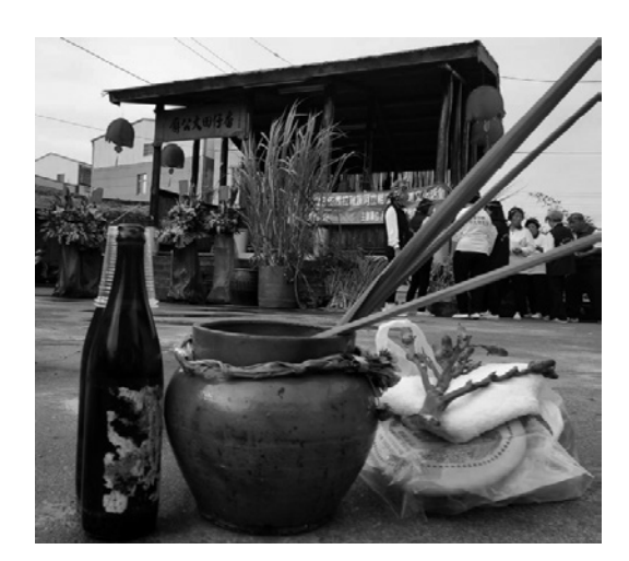
Figure 2. Showing kan-á (centre), beer bottle and betel nut. All are found in Sirayan temples and are important for worship.

Notice how the shaman contrasts religious traditions using an expression that in English is something like "worship via the bottle". Observing the shrines and religious events clearly highlights the salience of the sacramental jars (see Figure 2) as well as both bottles of water and beer in Shamanic practice. But without this vernacular expression kan- \acute{a} ( \vec{R} ) in mother-tongue Taiwanese, authenticity of descriptions of the religious practices would be lost.