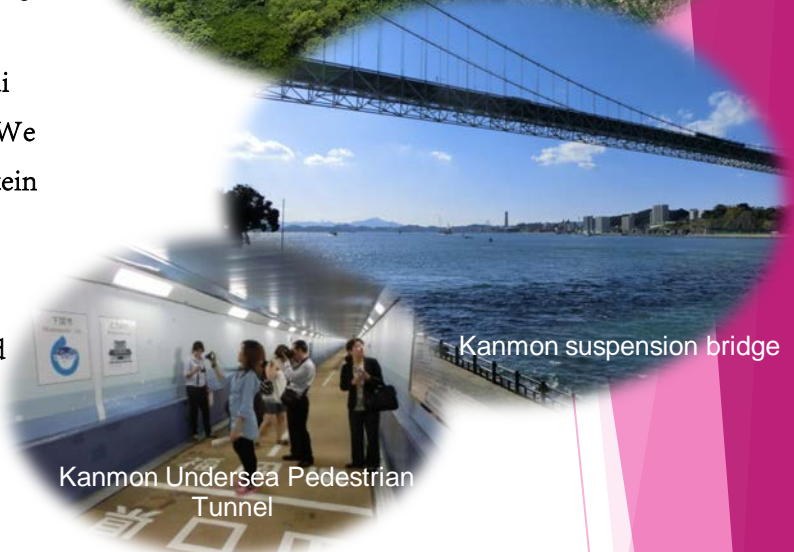
Kanmon suspension bridge