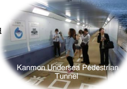
Kanmon Undersea Pedestrian Tunnel