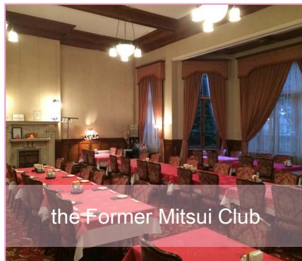
the Former Mitsui Club