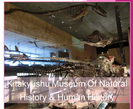
Kitakyushu Museum Of Natural History &amp; Human History