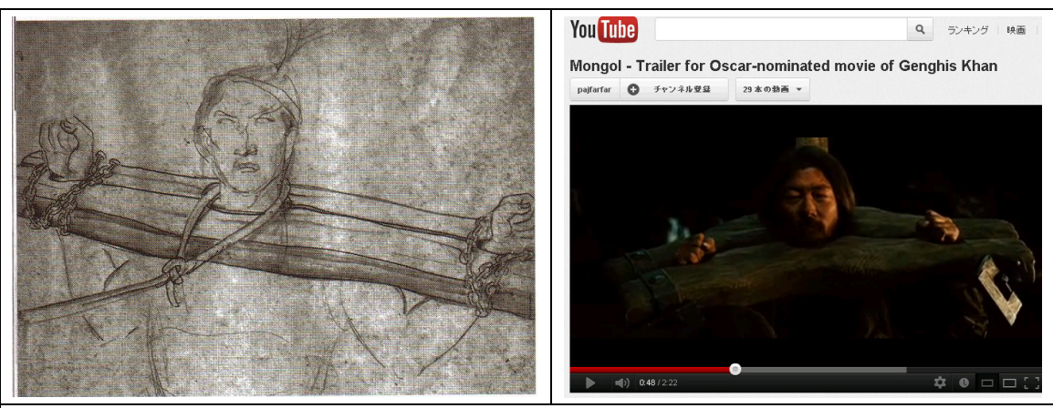
Figure 3. The capture of Temujin

People's Republic of China, mainly in Inner Mongolia and in Kazakhstan. The film was nominated for the 2007 Academy Award for Best Foreign Language Film<sup>19</sup> as a submission from Kazakhstan.<sup>20</sup> It could be the most faithful cinematic rendition to date of Genghis Khan. Figure 3 shows the uncanny resemblance of the wooden stock designed by Botong Francisco to that of the Oscar-nominated version.