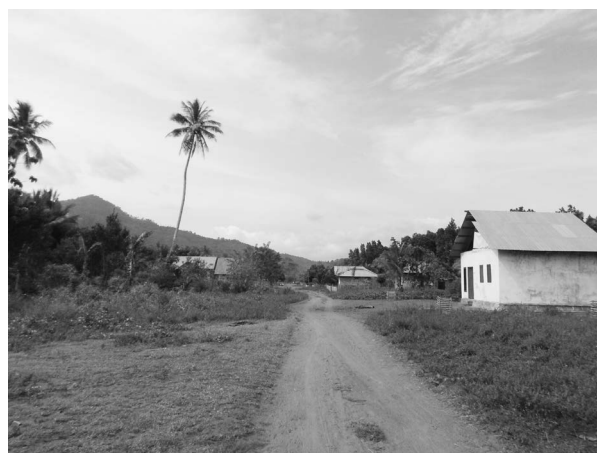
Fig 2. Lako Akediri Village on Sub District Sahu