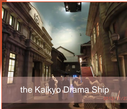
the Kaikyo Drama Ship