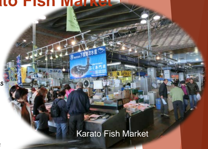
Karato Fish Market

Crossing the Kanmon Strait on the Kanmon suspension bridge, we will visit the Karato Fish Market in Shimonoseki, famous for its fugu (blowfish) dishes. On the weekends, the fish market has a special event in which many small food stalls are open to the public. Let's try some fresh and delicious Japanese seafood there, including the local specialty fugu. A five-minute walk will take us to Shunpanro. This was the site of the signing of the Treaty of Shimonoseki, which ended the First Sino-Japanese War (you can also visit if you are interested in.). Shunpanro was also the first restaurant in Japan to serve fugu dishes. Next, we will take a walk under the Kanmon Strait by the Kanmon Undersea Pedestrian Tunnel. It will take about ten minutes to reach the other side at Mojiko Retro . Here you can enjoy shopping and strolling through the retro area. Finally we will drop in the Kaikyo Drama Ship to see a representation of a mid-twentieth century Japanese town (Showa Era).